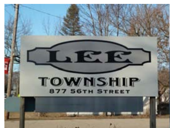
New Lee Township office sign finally arrived several months after severe wind damaged the old one.

*Every household should assemble a Disaster Supplies Kit containing: first aid kit, canned food and a can opener, several gallons of water, blankets or sleeping bags, battery powered radio, flashlight, and extra batteries, special items for infants, elderly or the disabled, and written instructions on how to turn off electricity, gas and water if authorities advise you to.