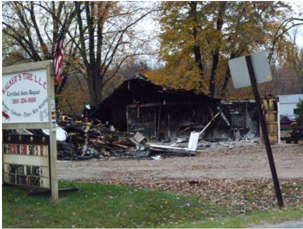
Photo of Walker Tire October 17, 2011